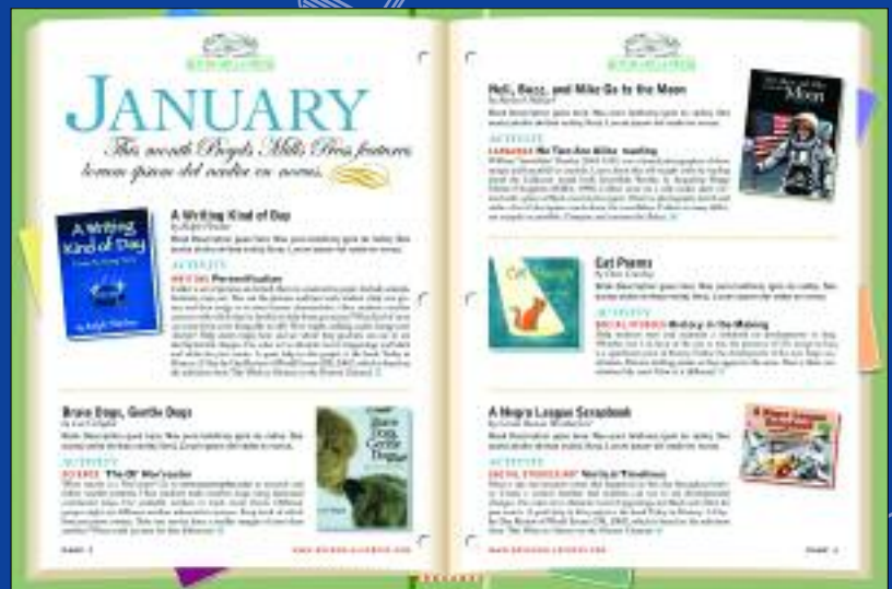
Sample spread from Teaching K-8's Children's Books by the Month Section.